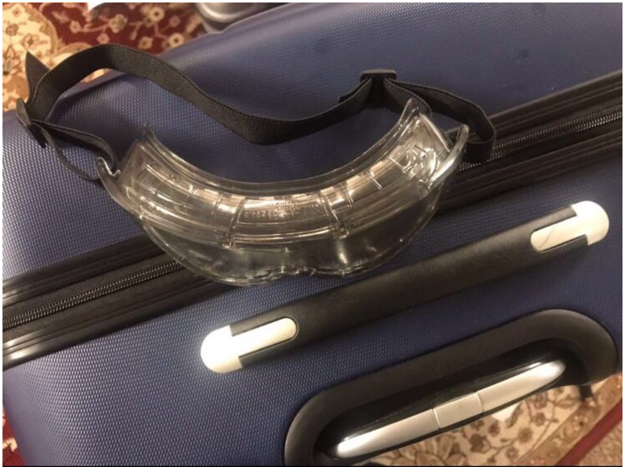
Blinds simulation device